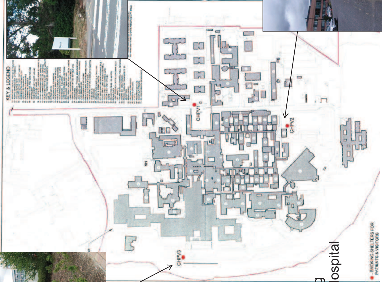
Location of Smoking Shelters Churchill Hospital Old Road